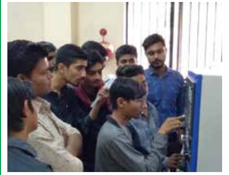
Live Training at Gondal SUC CNC Turning