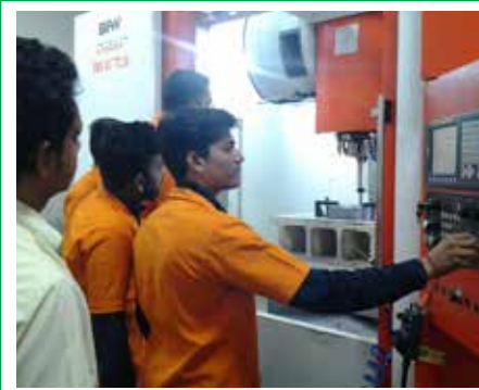
Skill Development | Shri Parantap Institute of CNC Programing