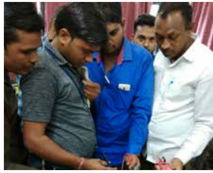
Live Training at Chhatral SUC Tower Technician