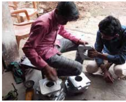
On-the-job training | Kalol GIDC

Below are the moments of live training across our various SUCs that is aimed at making the participants self - employable as well as better career prospects.