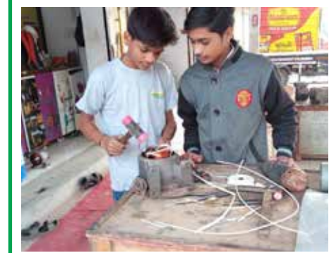
Electrical & Fitter Training | Kalol GIDC