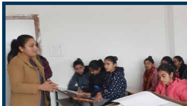
ITI Lathi, Amreli under Bhavnagar Region

EAW was recently held at following place: