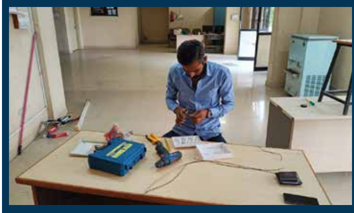
Electric Repairing Work at SUC Gondal

With a robust network of skill upgradation centres spread across the state, CED is paving the way for individuals to acquire valuable skills and knowledge through a diverse range of skill development courses, empowering them for a better future and self-reliance. Here are some recently organized courses: