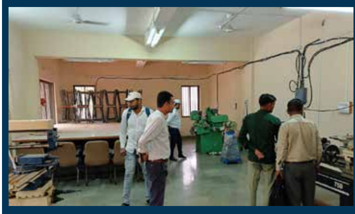
Electrical Work in Progress at SUC Dhandhuka