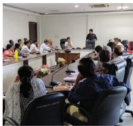
Seminar on BANKING & FINANCE