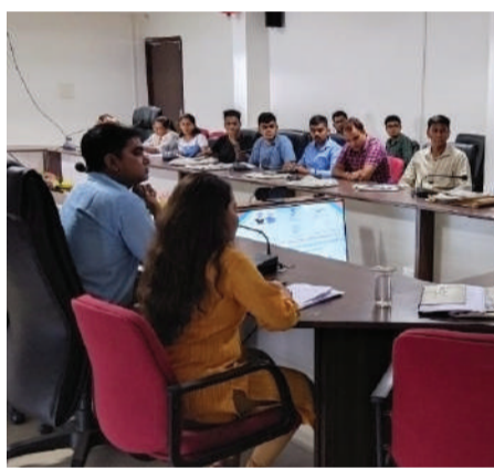
Seminar on E- WASTE