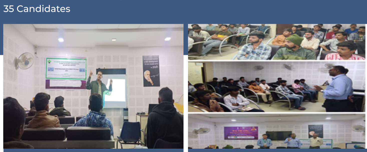
Session: Training Inauguration

Date: 22/02/2024 to 14/03/2024 19 Candidates