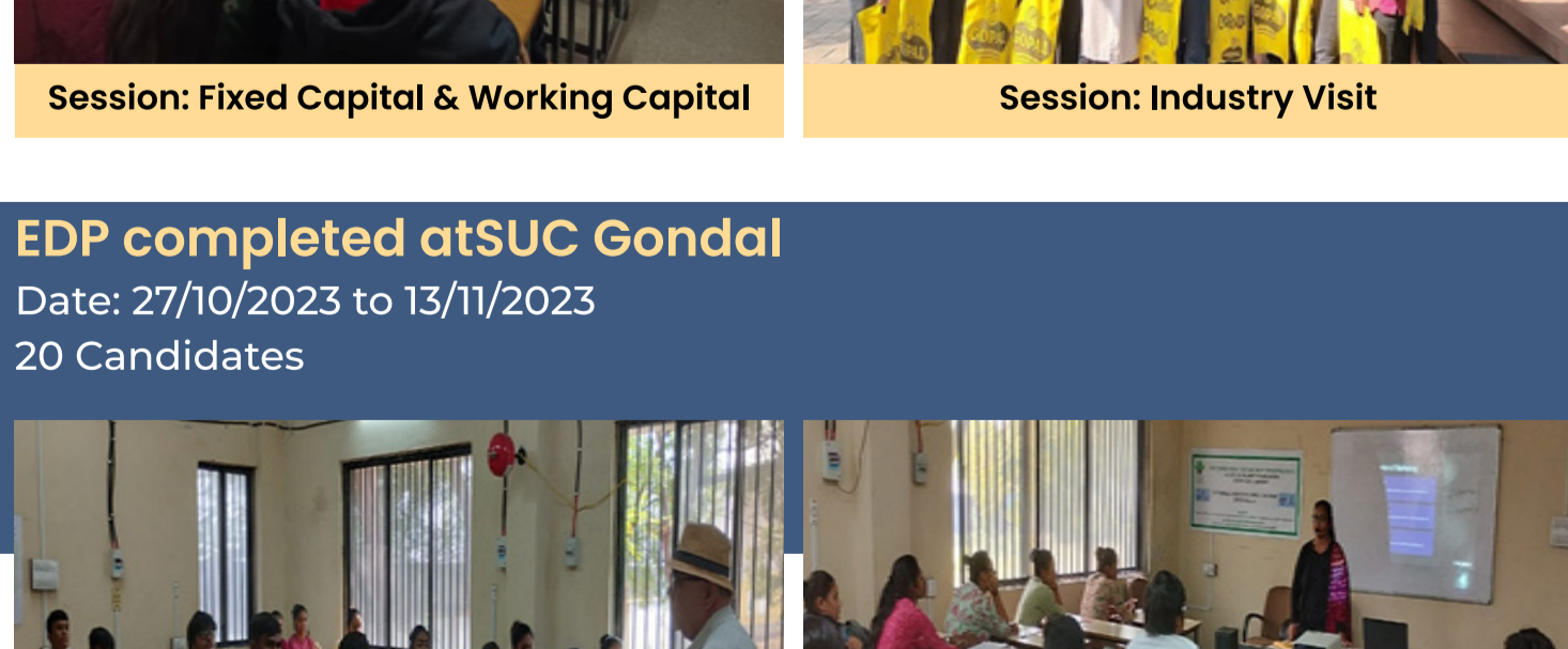
Session: Project Report

Date: 15/02/2024 to 06/03/2024 27 Candidates