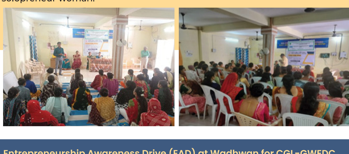
Glimpses of EDP completed at Rajkot Region Office (SUC Aji)

There are about 500 foundry units in Rajkot. The cluster came up mainly to cater to the casting requirements of the local diesel engine industry. The geographical spread of the cluster includes Aji Vasahat, Gondal Road, Bhavnagar Road areas, Shapar, Veraval and Metoda. The majority of foundry units in Rajkot produce grey iron castings for the domestic market. About 2% of the foundry units export castings such as electric motor castings and automobile castings.