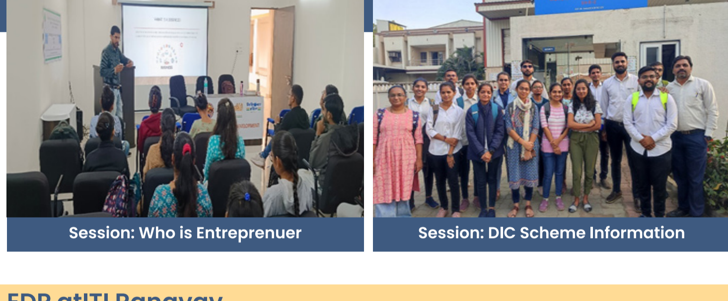
Session: Who is Entrepreneur

Date - 04/03/2024 to 23/03/2024 30 Candidates