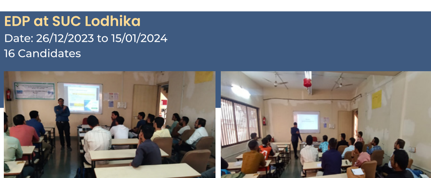
Session: About CED

Date: 22/02/2024 to 14/03/2024 34 Candidates